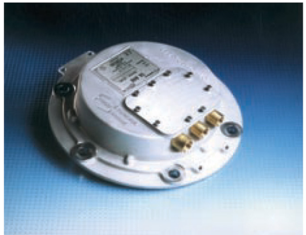
Auxitrol TA- 840 Radar

Totem Plus Ltd. Where shipping Meets High-Tech